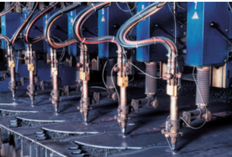
Mechanical flame cutting with multitouch operation